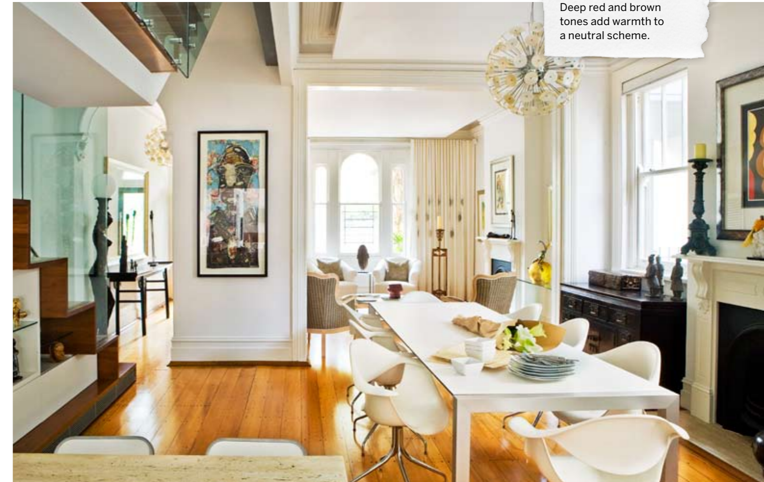
Styling by Babette Hayes (opposite). Paint colours are reproduced as accurately as printing processes will allow.

OPPOSITE High-impact pendant lights from Z Two Lights and concealed lighting in the blackbutt staircase risers illuminate a globe-spanning collection of art and sculpture. Artworks by Diego Mendoza. For Where to Buy, see page 248.