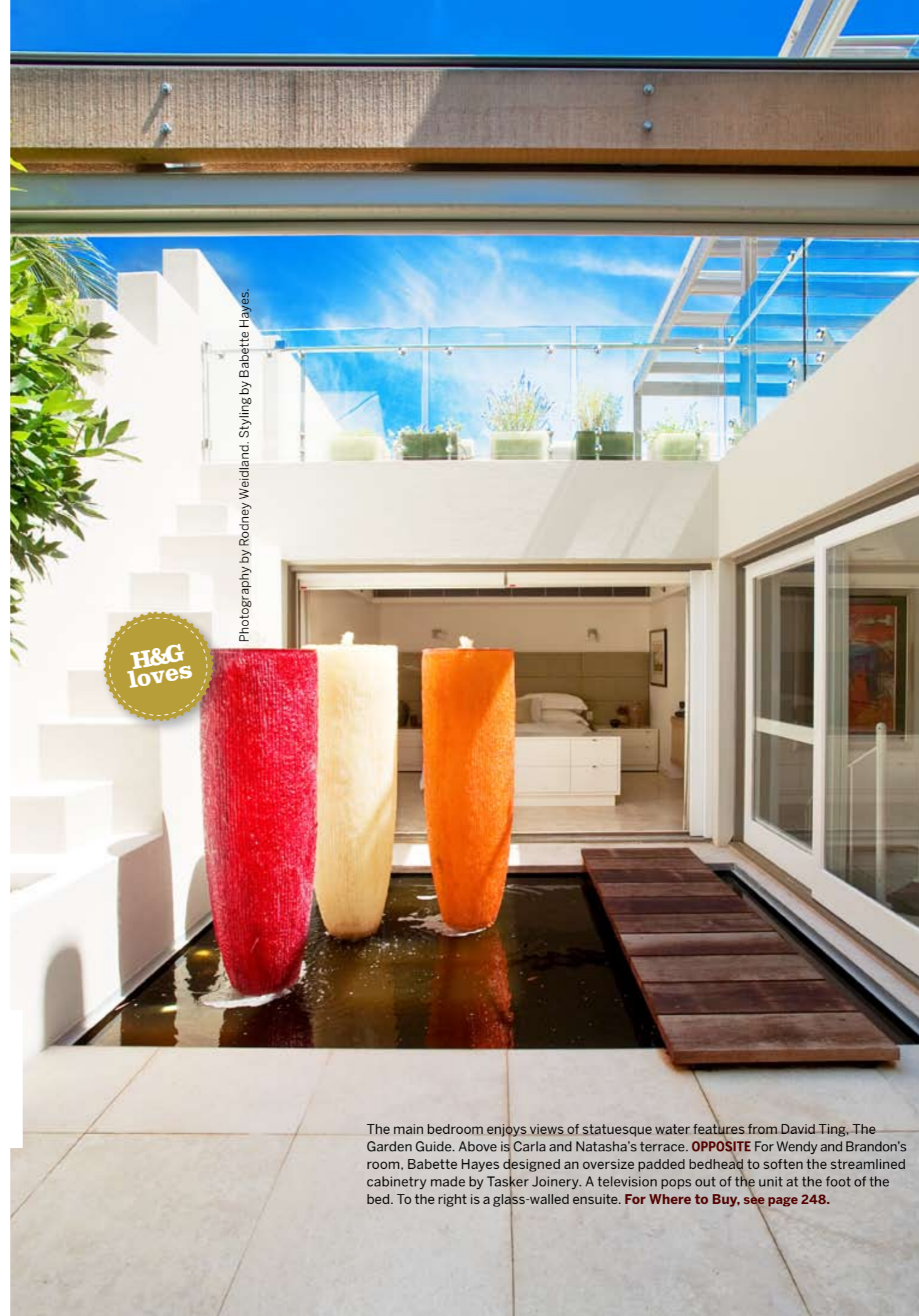
Styling by Babette Hayes.